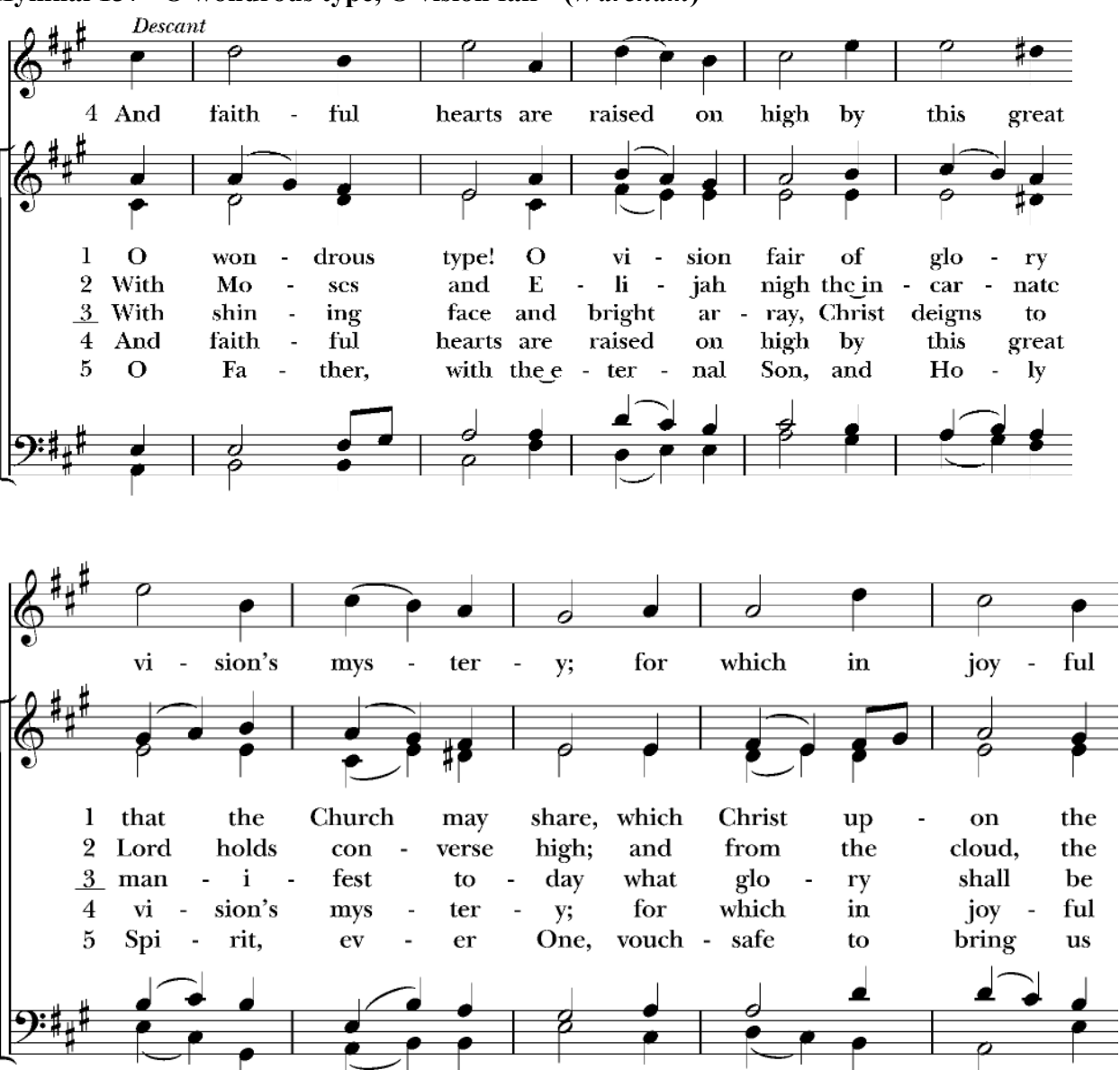
Hymnal 137 "O wondrous type, O vision fair" (Wareham)