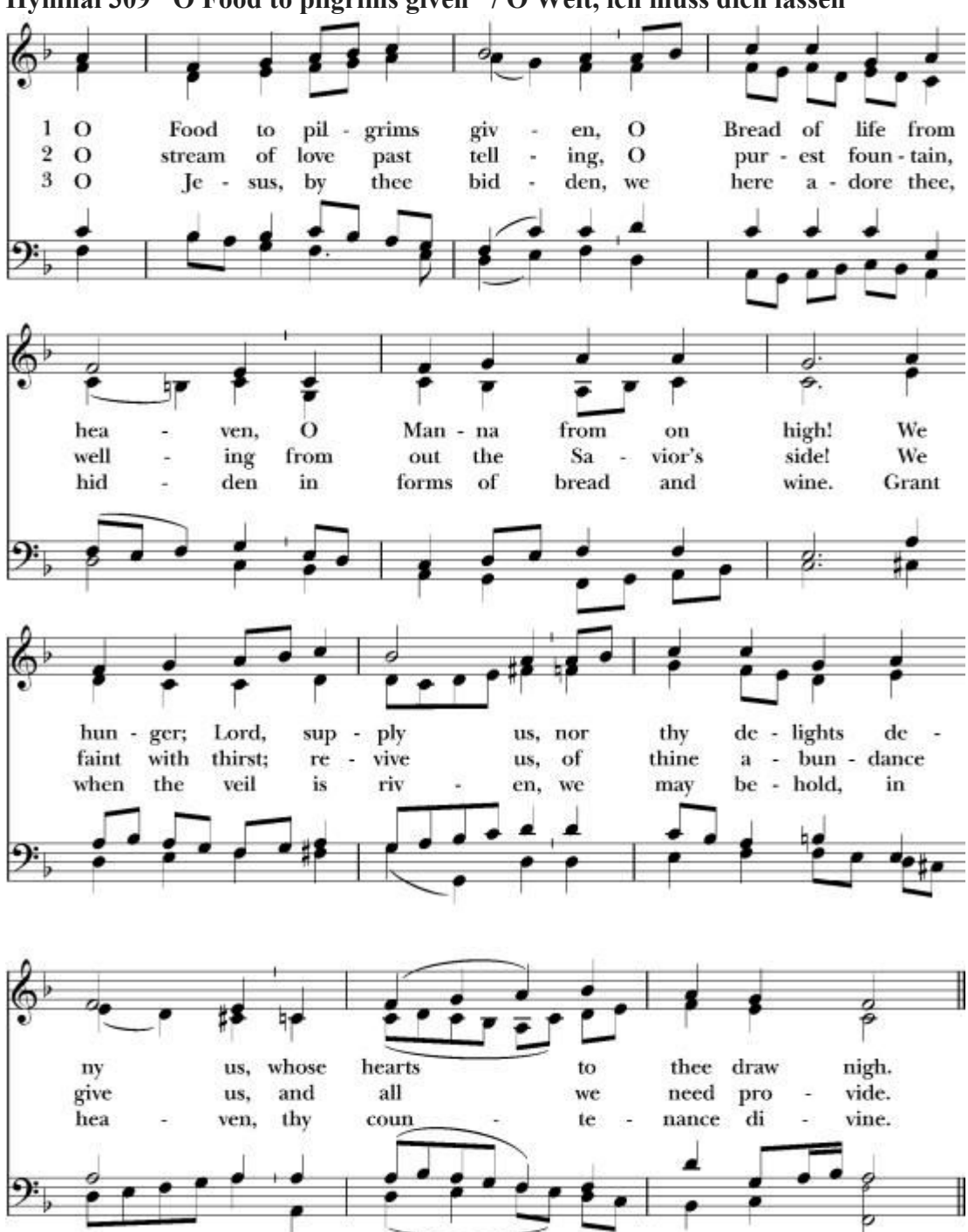
Hymnal 309 "O Food to pilgrims given" / O Welt, ich muss dich lassen