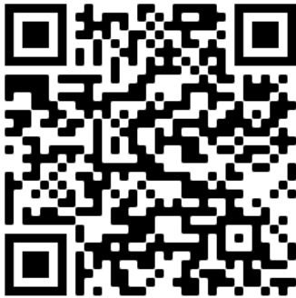
STATEMENT OF COMMITMENT & ACTION

We acknowledge the land on which we are gathered. For thousands of years, this land has been the home of Patwin people. Today, there are three federally-recognized Patwin tribes: Cachil Dehe Band of Wintun Indians of the Colusa Indian Community, Kletsel Dehe Wintun Nation, and Yocha Dehe Wintun Nation. The Patwin people have remained committed to the stewardship of this land over many centuries. It has been cherished and protected, as elders have instructed the young through generations. We are honored and grateful to be here today on their traditional lands.