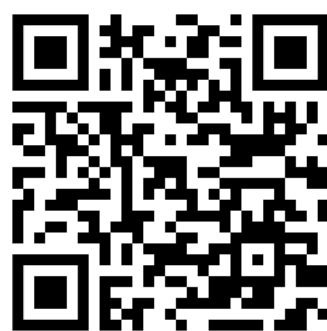
TITHELY: GIVE WITH A CLICK