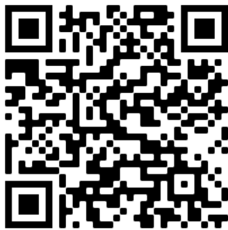
STATEMENT OF COMMITMENT & ACTION