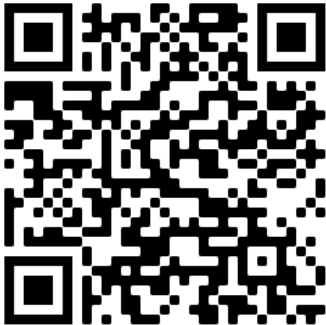
STATEMENT OF COMMITMENT & ACTION

We acknowledge the land on which we are gathered. For thousands of years, this land has been the home of Patwin people. Today, there are three federally-recognized Patwin tribes: Cachil Dehe Band of Wintun Indians of the Colusa Indian Community, Kletsel Dehe Wintun Nation, and Yocha Dehe Wintun Nation. The Patwin people have remained committed to the stewardship of this land over many centuries. It has been cherished and protected, as elders have instructed the young through generations. We are honored and grateful to be here today on their traditional lands.