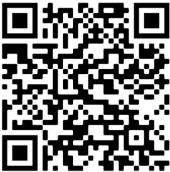
STATEMENT OF COMMITMENT & ACTION