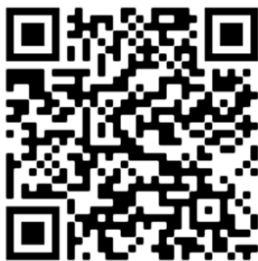
STATEMENT OF COMMITMENT & ACTION

We acknowledge the land on which we are gathered. For thousands of years, this land has been the home of Patwin people. Today, there are three federally-recognized Patwin tribes: Cachil Dehe Band of Wintun Indians of the Colusa Indian Community, Kletsel Dehe Wintun Nation, and Yocha Dehe Wintun Nation. The Patwin people have remained committed to the stewardship of this land over many centuries. It has been cherished and protected, as elders have instructed the young through generations. We are honored and grateful to be here today on their traditional lands.