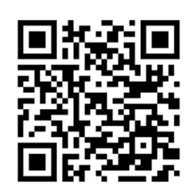
TITHELY: GIVE WITH A CLICK