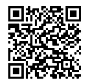
STATEMENT OF COMMITMENT & ACTION

We acknowledge the land on which we are gathered. For thousands of years, this land has been the home of Patwin people. Today, there are three federally-recognized Patwin tribes: Cachil Dehe Band of Wintun Indians of the Colusa Indian Community, Kletsel Dehe Wintun Nation, and Yocha Dehe Wintun Nation. The Patwin people have remained committed to the stewardship of this land over many centuries. It has been cherished and protected, as elders have instructed the young through generations. We are honored and grateful to be here today on their traditional lands.