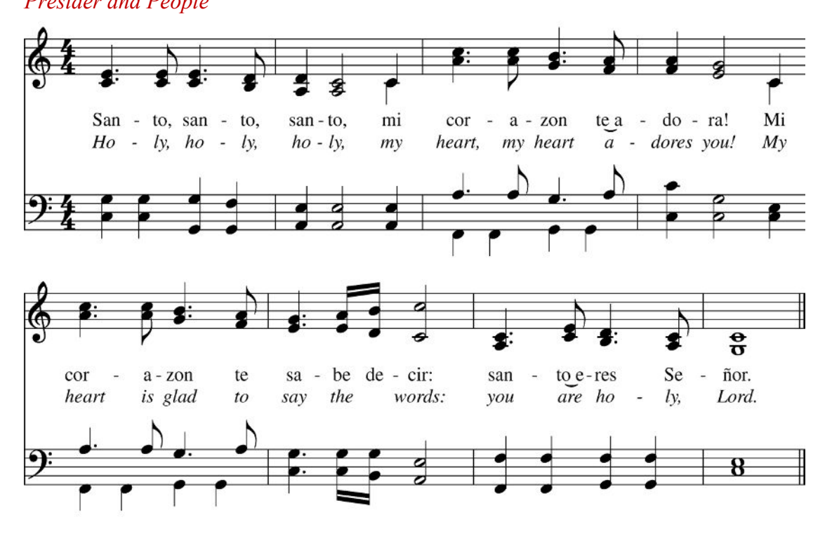
SANCTUS WLP 785 "Santo, Santo, Santo" Presider and People

We praise you and we bless you, holy and gracious God, source of life abundant. From before time you made ready the creation. Your Spirit moved over the deep and brought all things into being: sun, moon, and stars; earth, winds, and waters; and every living thing. You made us in your image, and taught us to walk in your ways. But we rebelled against you, and wandered far away; and yet, as a mother cares for her children, you would not forget us. Time and again you called us to live in the fullness of your love. And so this day we join with Saints and Angels in the chorus of praise that rings through eternity, lifting our voices to magnify you as we sing: