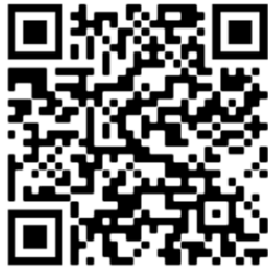
STATEMENT OF COMMITMENT & ACTION

We acknowledge the land on which we are gathered. For thousands of years, this land has been the home of Patwin people. Today, there are three federally-recognized Patwin tribes: Cachil Dehe Band of Wintun Indians of the Colusa Indian Community, Kletsel Dehe Wintun Nation, and Yocha Dehe Wintun Nation. The Patwin people have remained committed to the stewardship of this land over many centuries. It has been cherished and protected, as elders have instructed the young through generations. We are honored and grateful to be here today on their traditional lands.