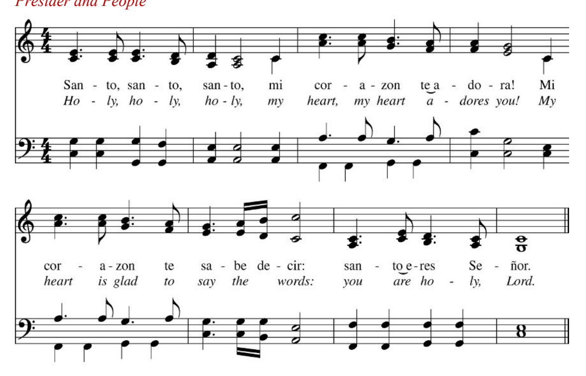
SANCTUS WLP 785 "Santo, Santo, Santo" Presider and People

We praise you and we bless you, holy and gracious God, source of life abundant. From before time you made ready the creation. Your Spirit moved over the deep and brought all things into being: sun, moon, and stars; earth, winds, and waters; and every living thing. You made us in your image, and taught us to walk in your ways. But we rebelled against you, and wandered far away; and yet, as a mother cares for her children, you would not forget us. Time and again you called us to live in the fullness of your love. And so this day we join with Saints and Angels in the chorus of praise that rings through eternity, lifting our voices to magnify you as we sing: