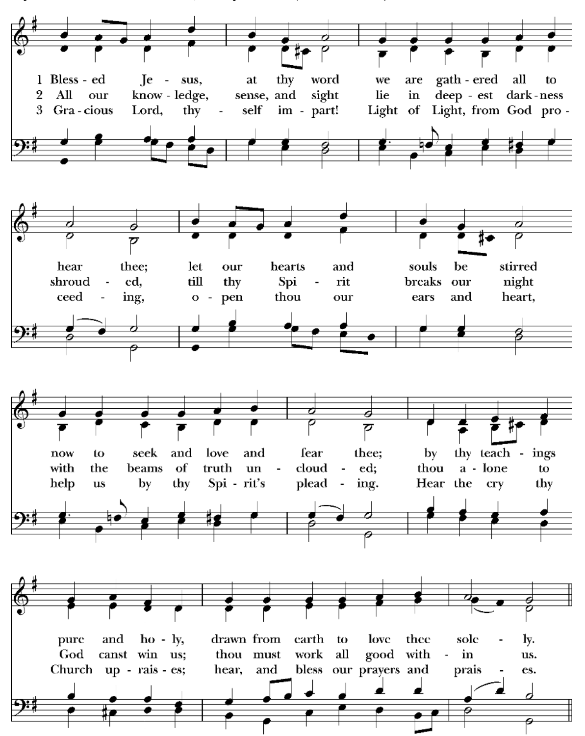
Hymnal 440 "Blessed Jesus, at thy word" (Liebster Jesu)