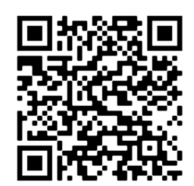
STATEMENT OF COMMITMENT & ACTION

We acknowledge the land on which we are gathered. For thousands of years, this land has been the home of Patwin people. Today, there are three federally-recognized Patwin tribes: Cachil Dehe Band of Wintun Indians of the Colusa Indian Community, Kletsel Dehe Wintun Nation, and Yocha Dehe Wintun Nation. The Patwin people have remained committed to the stewardship of this land over many centuries. It has been cherished and protected, as elders have instructed the young through generations. We are honored and grateful to be here today on their traditional lands.