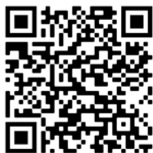
STATEMENT OF COMMITMENT & ACTION

We acknowledge the land on which we are gathered. For thousands of years, this land has been the home of Patwin people. Today, there are three federally-recognized Patwin tribes: Cachil Dehe Band of Wintun Indians of the Colusa Indian Community, Kletsel Dehe Wintun Nation, and Yocha Dehe Wintun Nation. The Patwin people have remained committed to the stewardship of this land over many centuries. It has been cherished and protected, as elders have instructed the young through generations. We are honored and grateful to be here today on their traditional lands.