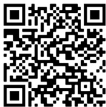
STATEMENT OF COMMITMENT & ACTION