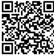
STATEMENT OF COMMITMENT AND ACTION

The Episcopal Church of St. Martin • 640 Hawthorn Lane • Davis, California • 95616 (530) 756-0444 • info@churchofstmartin.org • www.churchofstmartin.org