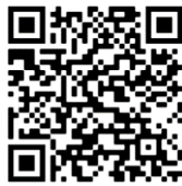
STATEMENT OF COMMITMENT AND ACTION

We acknowledge the land on which we are gathered. For thousands of years, this land has been the home of Patwin people. Today, there are three federally-recognized Patwin tribes: Cachil Dehe Band of Wintun Indians of the Colusa Indian Community, Kletsel Dehe Wintun Nation, and Yocha Dehe Wintun Nation. The Patwin people have remained committed to the stewardship of this land over many centuries. It has been cherished and protected, as elders have instructed the young through generations. We are honored and grateful to be here today on their traditional lands.