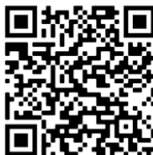
STATEMENT OF COMMITMENT AND ACTION