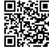
TITHELY: GIVE WITH A CLICK

Our church services may involve photography and/or video recordings which may contain your likeness. By attending, you consent to the photography, recording, distribution, or any other lawful use of the materials and waive any and all rights you may have in connection with such materials. Any such images and recordings will be the property of The Episcopal Church of St. Martin (the "Church") and may be used by the Church or its agents for further distribution or marketing on its website, streamed to those off-site, or in printed materials to share our programs and activities. You also hereby release the Church and its leadership, staff, or agents from any liability that may arise from the use of such materials. Your consent, waiver, and release shall extend to any individual who is under your care, guardianship, or agency. If you do not consent to being photographed or videotaped during this service, please sit in the back five rows on either side.