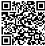
STATEMENT OF COMMITMENT AND ACTION