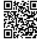
TITHELY: GIVE WITH A CLICK

The Episcopal Church of St. Martin • 640 Hawthorn Lane • Davis, California • 95616 (530) 756-0444 • info@churchofstmartin.org • www.churchofstmartin.org