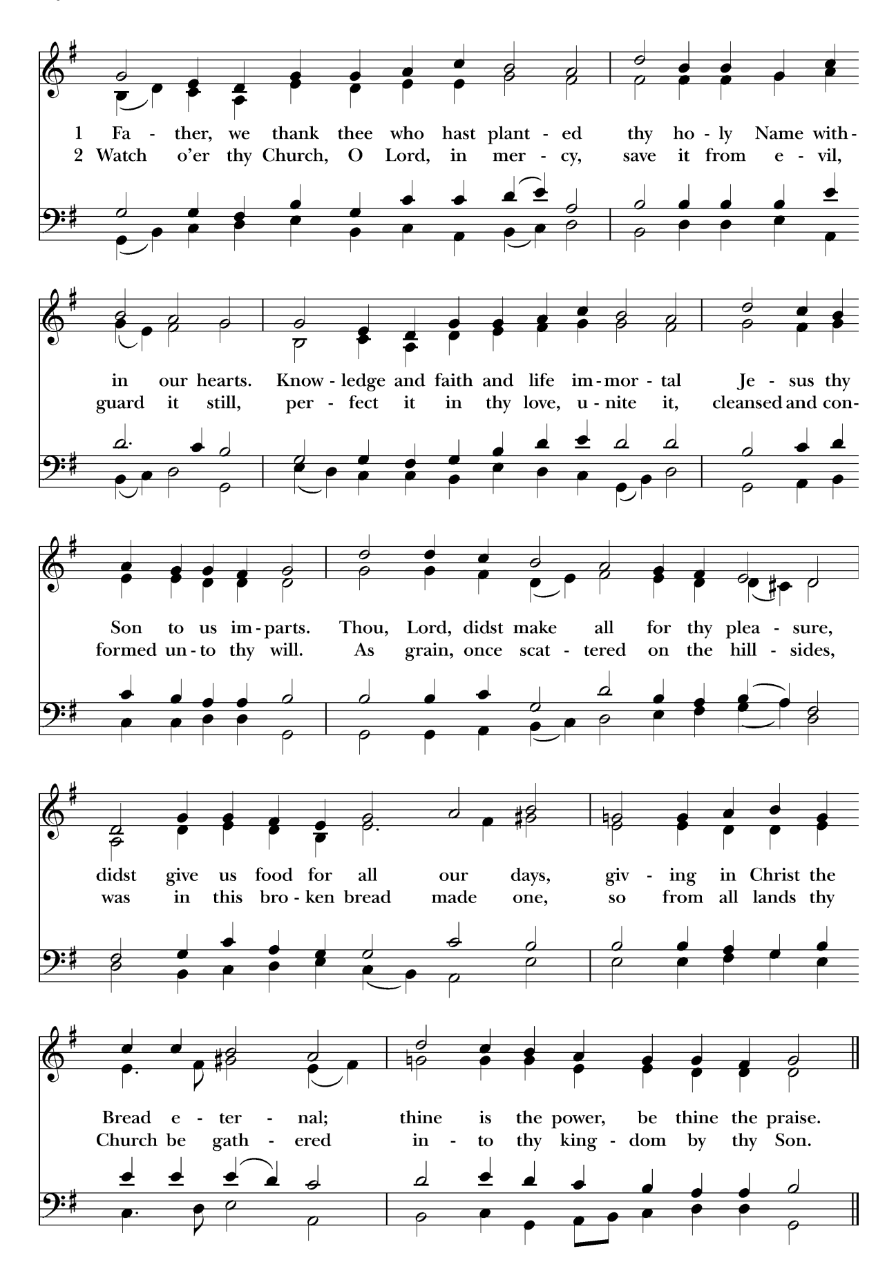
Hymnal 302 "Father we thank thee" ( Rendez à Dieu )