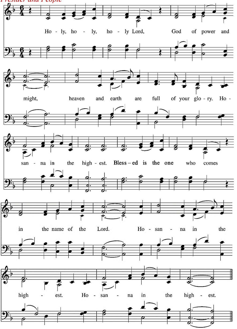
Presider and People

SANCTUS Wonder, Love, and Praise 858 (Land of Rest)