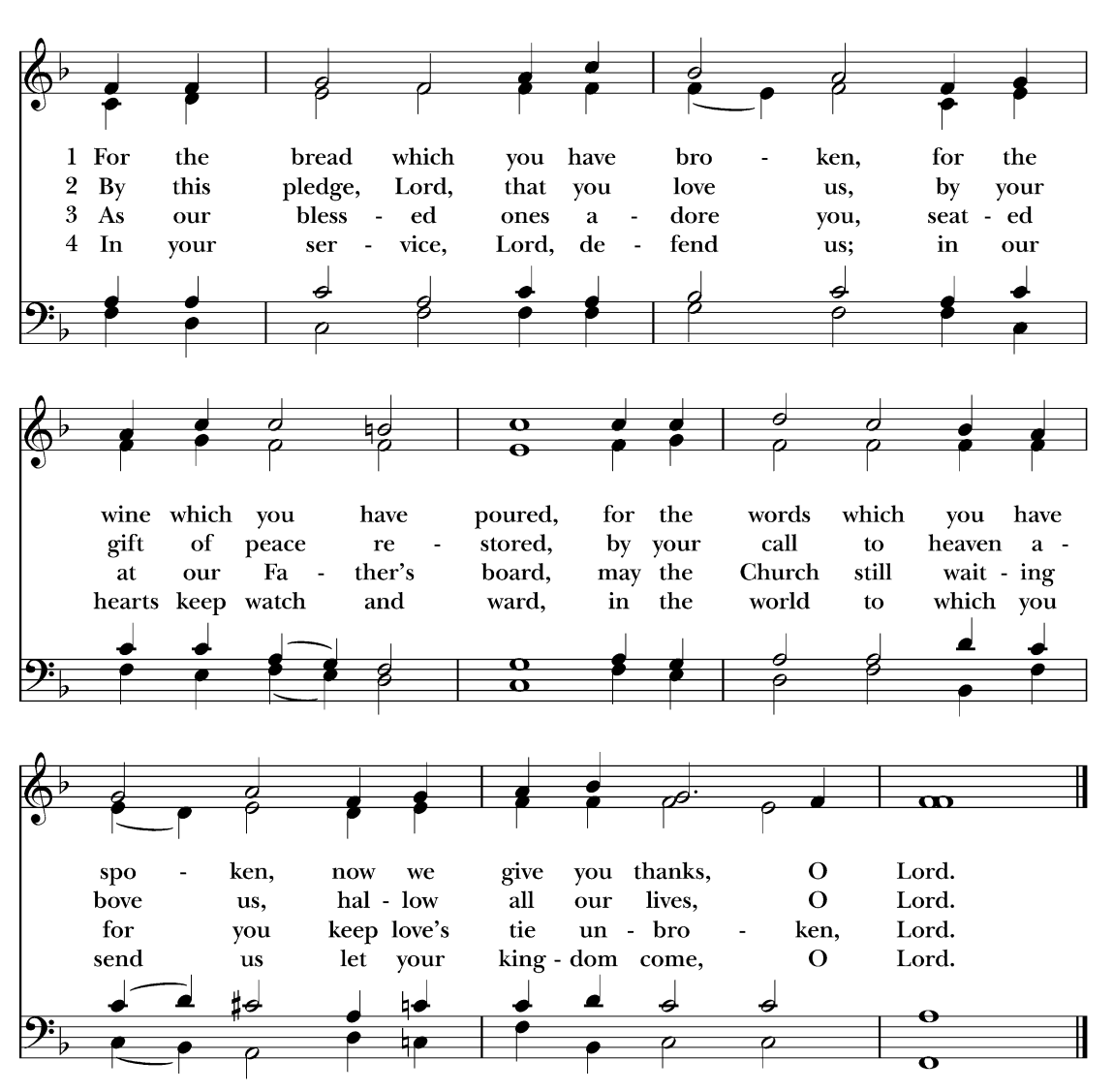
Hymnal 341 "For the bread which you have broken" (Omni die)