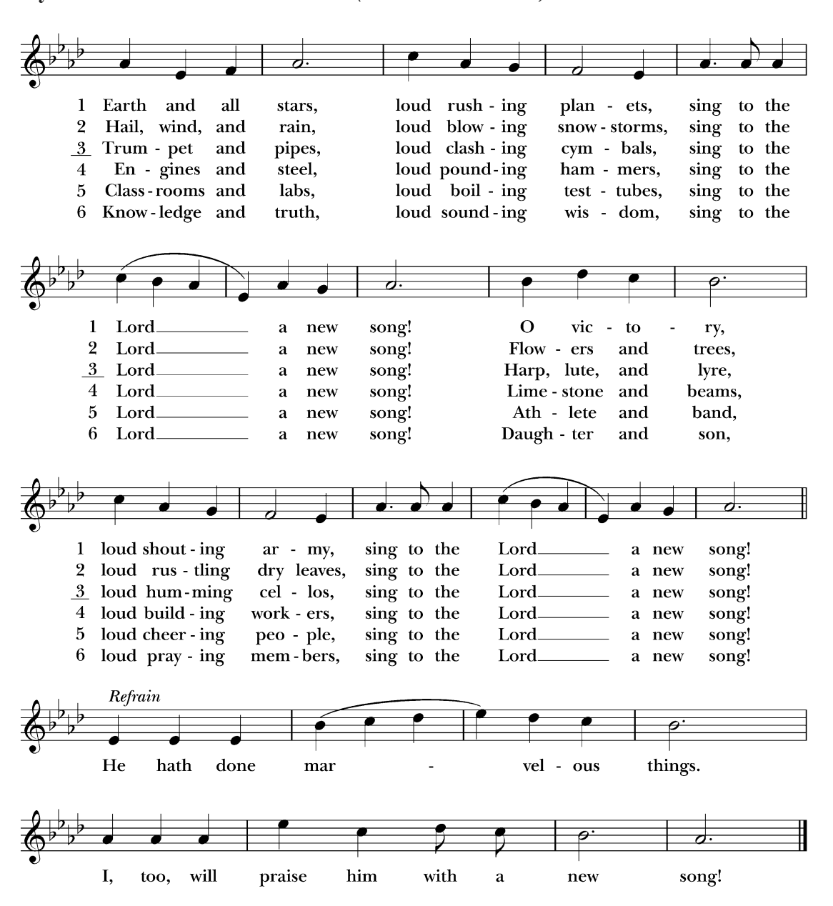
Hymnal 412 "Earth and all stars" (Earth and all stars)