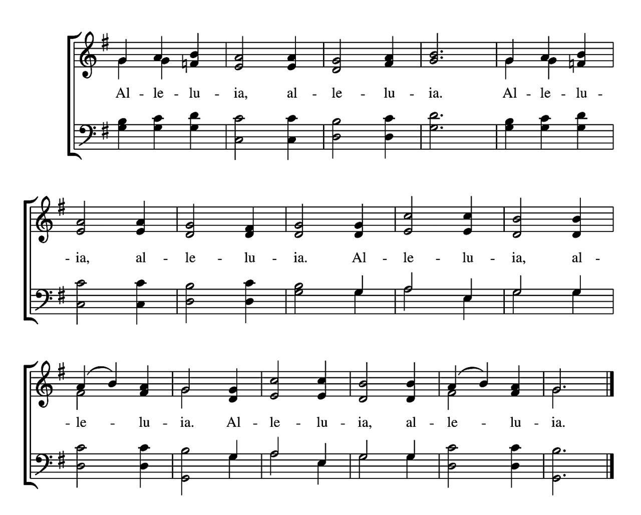
EOM2 120 "Alleluia Gospel Acclamation" (South African)

Setting: South African, arr. Gobingca Mxadana © Gobingca Mxadana. Used by permission. All rights reserved.