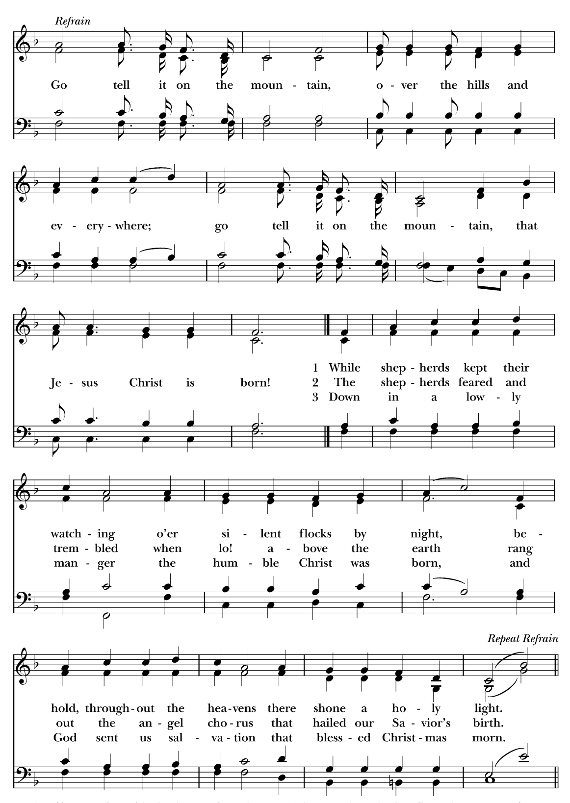
Hymnal 99 "Go tell it on the mountain" (Go Tell it on the Mountain)