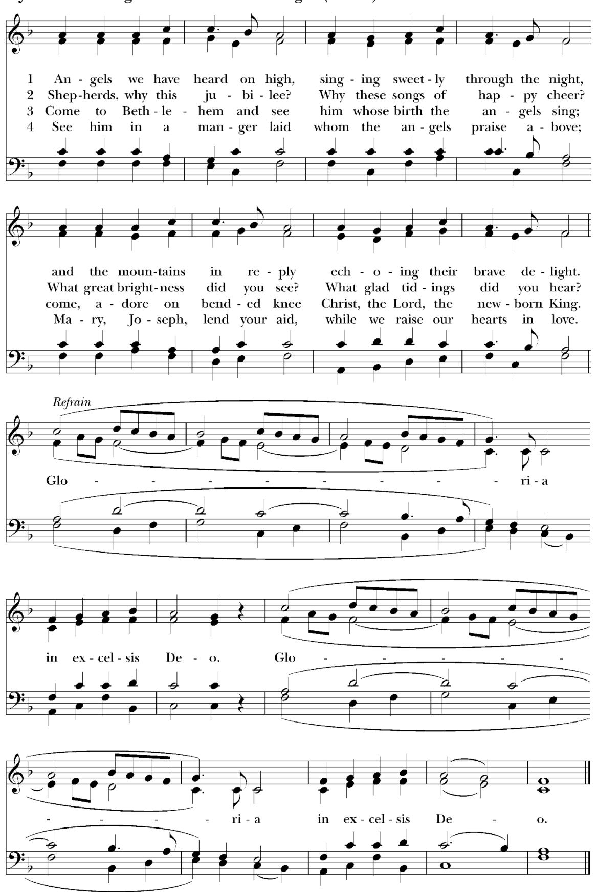
Hymnal 96 "Angels we have heard on high" (Gloria)