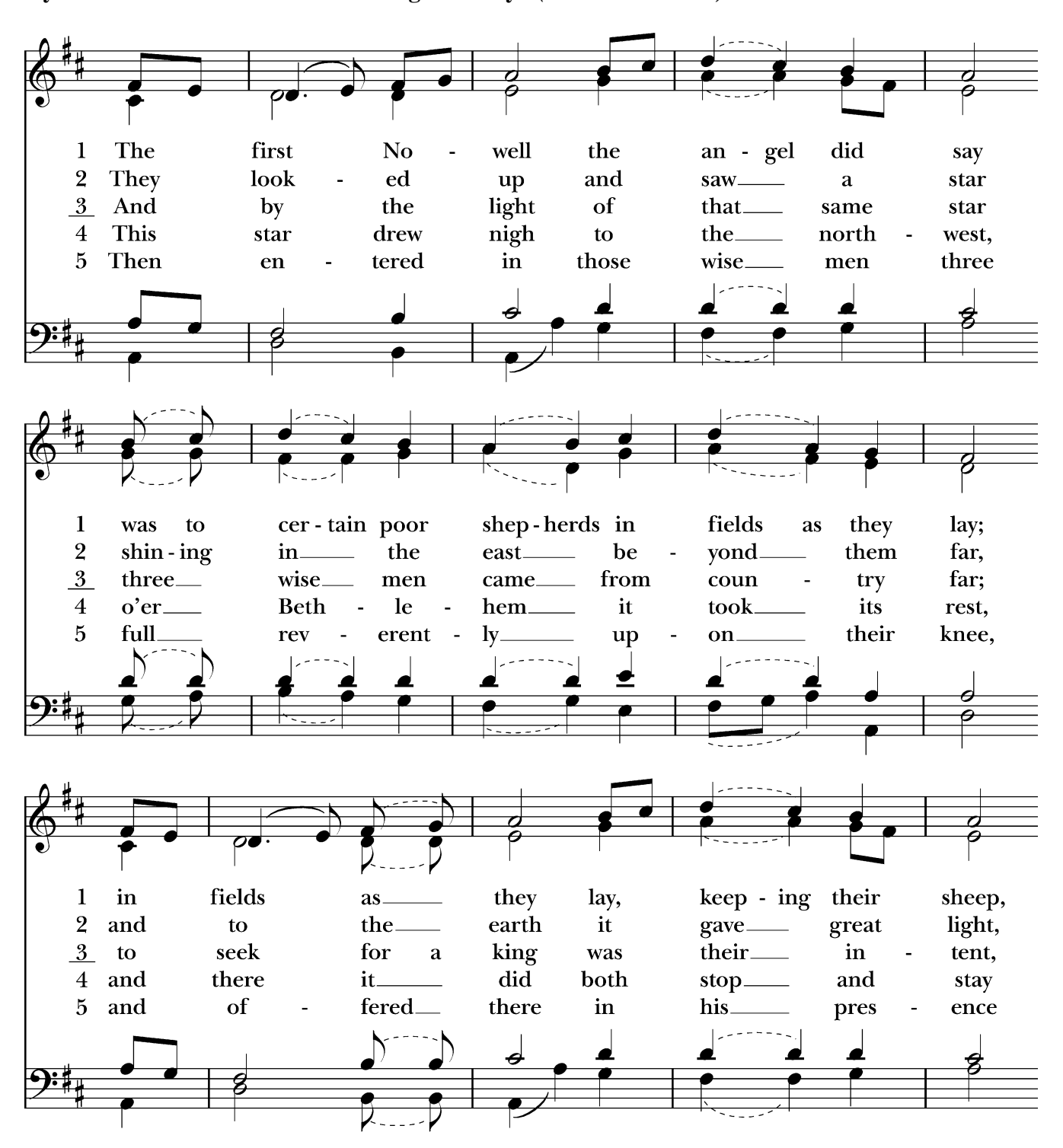
Hymnal 109 "The first Nowell the angel did say" (The First Nowell)