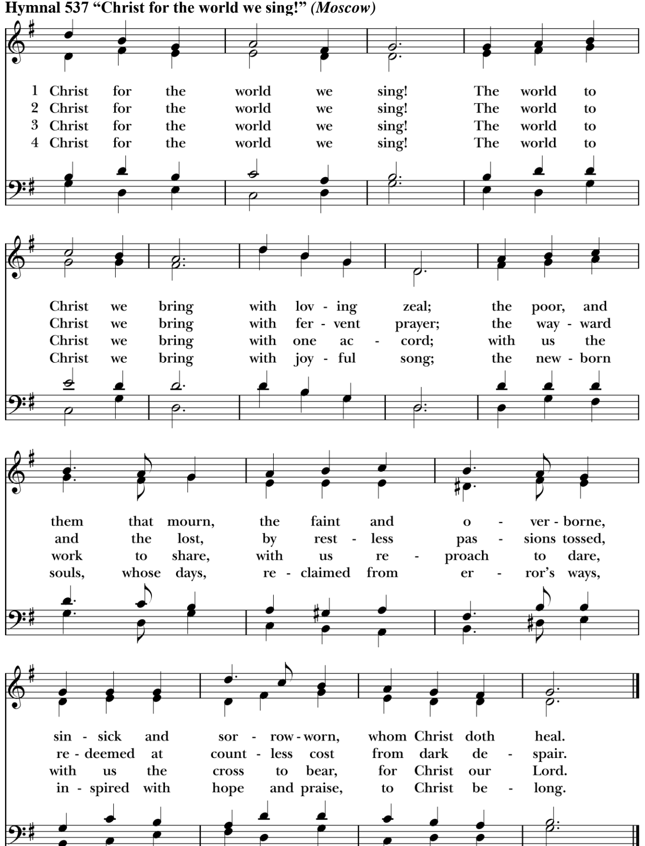
Hymnal 537 "Christ for the world we sing!" (Moscow)