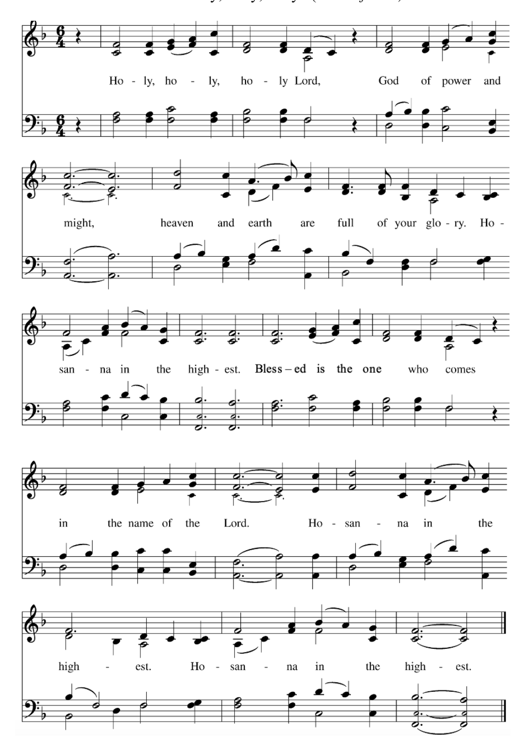
WORDS OF INSTITUTION The People stand or kneel. The Presider continues

SANCTUS WLP 858 "Holy, Holy, Holy" ( Land of Rest )