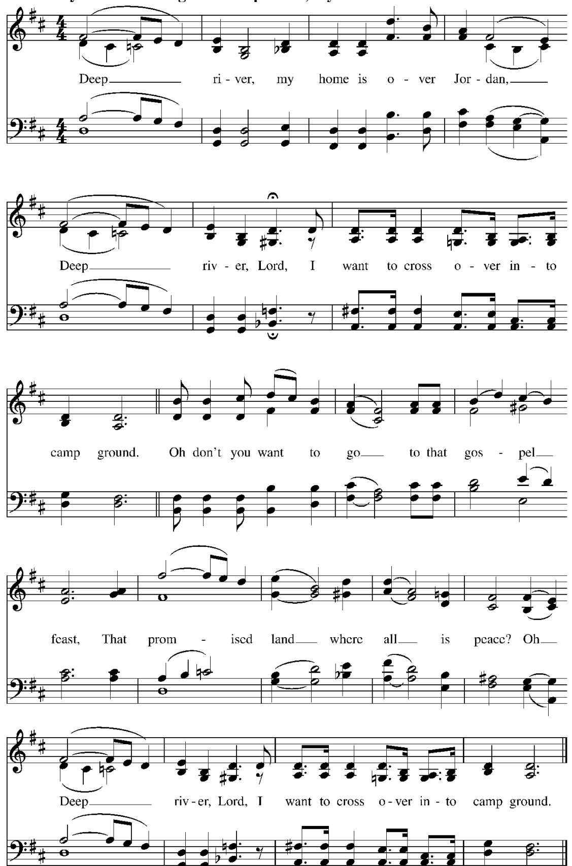
Lift Every Voice and Sing II 8 "Deep River, my home is over Jordan"