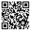
STATEMENT OF COMMITMENT AND ACTION