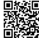
TITHELY: GIVE WITH A CLICK

The Episcopal Church of St. Martin • 640 Hawthorn Lane • Davis, California • 95616 (530) 756-0444 • info@churchofstmartin.org • www.churchofstmartin.org We are a carbon neutral church.